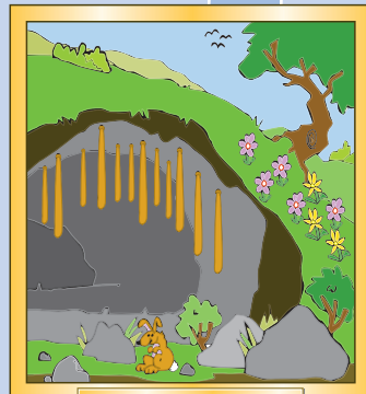
BATS IN A CAVE

I ASKED YOU TO PAINT ME A BAT IN A CAVE! BUT NOT THAT KIND OF BAT!