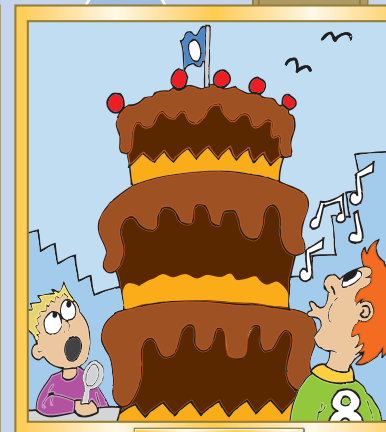
A GIANT CAKE