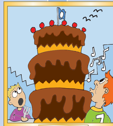
A GIANT CAKE